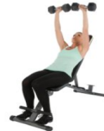
Angled Bench Presses