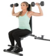
Seated Military Shoulder Presses